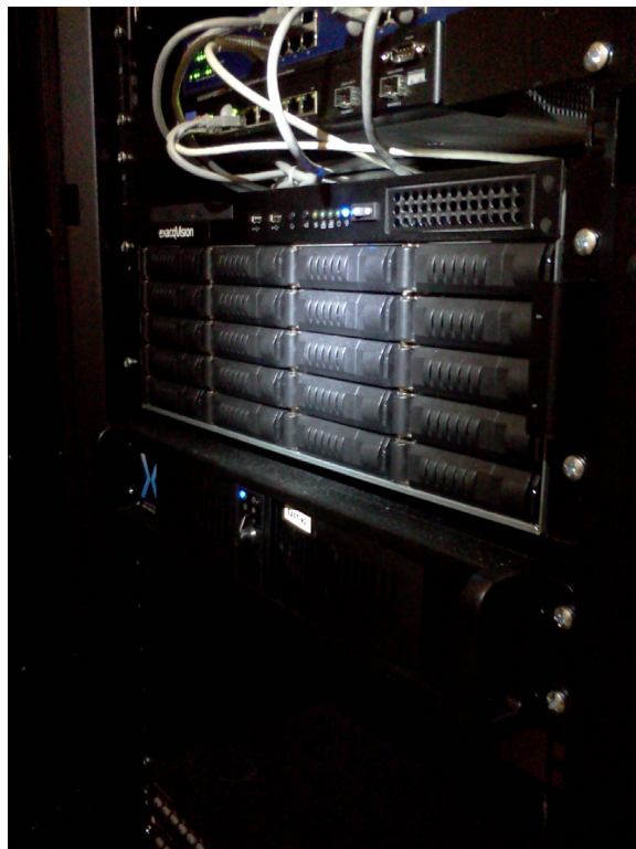
exacqVision Z-Series 4U hybrid server installed in the East Campus.

The deployment of the exacqVision surveillance system has substantially lowered the hospital's operational costs and created a feeling of security in all of its staff, patients and visitors.