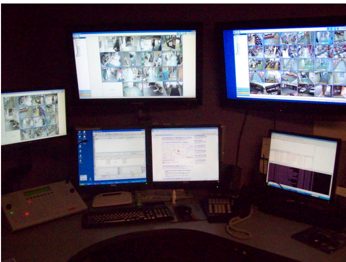
exacqVision VMS software is displayed on the video wall for staff members to see and monitor hospital activity.

FMC selected exacqVision A-Series 2U hybrid servers and exacqVision Z-Series 4U hybrid servers equipped with exacqVision Enterprise VMS software to enhance safety for its patients, visitors and staff. Additionally, Tel Tech installed two exacqVision EI-Series servers to cover their