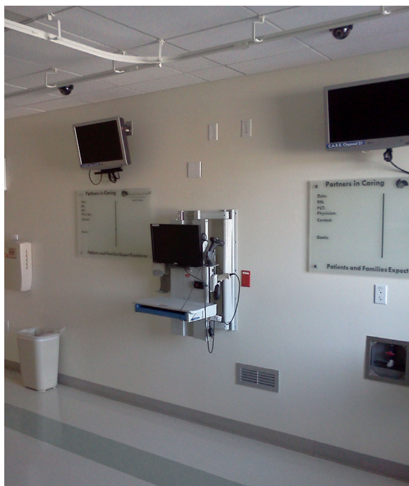
New IP cameras were installed in patient rooms to improve the patient monitoring system.