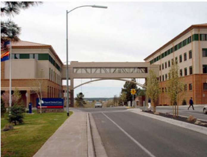
Flagstaff Medical Center enhanced their security system and patient treatment with the exacqVision surveillance solution.

Since 1936, Flagstaff Medical Center (FMC) has been providing high quality healthcare services to residents and visitors of Northern Arizona. As a regional referral center, FMC offers services that are not normally found outside a major metropolitan area: Level I trauma center, pediatric intensive care unit, cancer center, special care nursery and a bariatric surgical weight loss program.