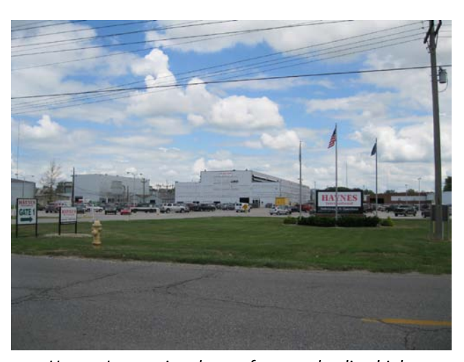
Haynes International manufacturers leading highperformance alloys.

Nelson Alarm installed new Arecont Vision cameras to monitor the buildings, the guard house, parking lots and perimeter of the facility.