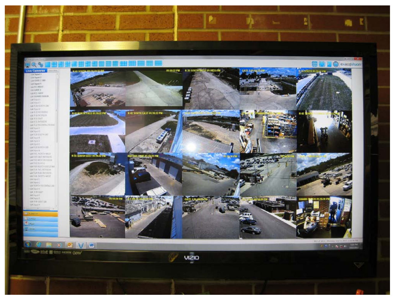
The exacqVision VMS software is displayed on the wall in the guard station so the guards can regularly view tours around the facility.

Two exacqVision Z-Series servers, one for the North campus and one for the South campus, were installed. The exacqVision Z-Series servers provide Haynes with a high-performance, reliable system. Each enterprise-class server allows Haynes International to connect up to 128 IP cameras with up to 80TB of total storage.